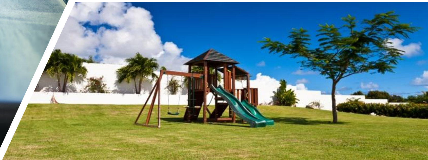
Le Bleu also features a fully equipped gym, Children's Play Area and Cinema Room